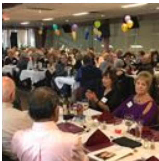
Enjoying the Gala