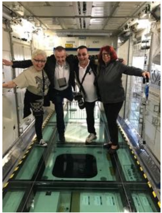
Interliners in Space

The next day 30 of us spent the day travelling by carpool to the Boeing "Future of Flight" complex near Everett Wash. We had a wonderful lunch at Ivar's Seafood restaurant in Mukilteo, then went to the Boeing tour, going through this amazing huge hangar where the planes are assembled ...saw the huge "Dreamliner 787" even. In the presentation building there are several floors with exhibits and a rooftop lounge area where you can watch planes taking off and landing and hear the "tower talk". My favorite exhibit was the exact replica of the International Space Station lab module....this I.S.S. is orbiting the earth about 200 miles above observing climate changes and conducting experiments onboard... very interesting. This was a great day, very impressive and enjoyable. After driving back to Richmond we then went to a party for out of towners and the WACA executive, held at Judith's. We discussed how successful our Gala was and the WACA President ..Maga Ramasamy even suggested that we make this an annual event. Maybe !!!!