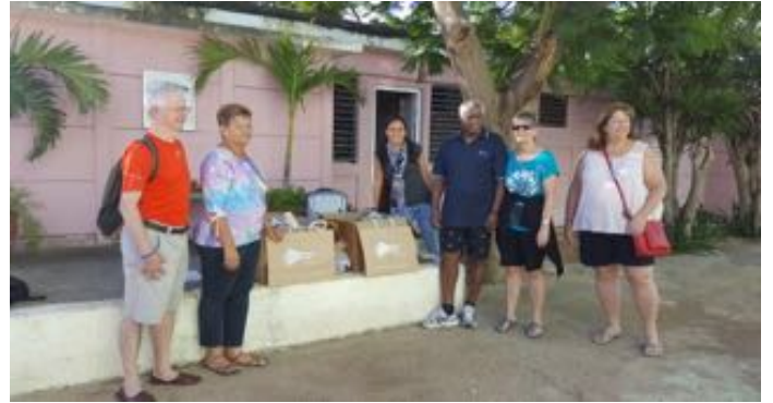
Members of WACA delivered school supplies donated by various Interline Clubs around the world.

The second day we all enjoyed a full day city tour of Havana including a delicious lunch. In the evening we enjoyed dinner at the Habana Cafe of Melia and were entertained by the Buena Vista Club Music Show. The show was awesome!