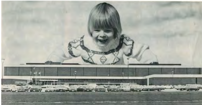
OPENING OF THE CPAIR OPS CENTRE.